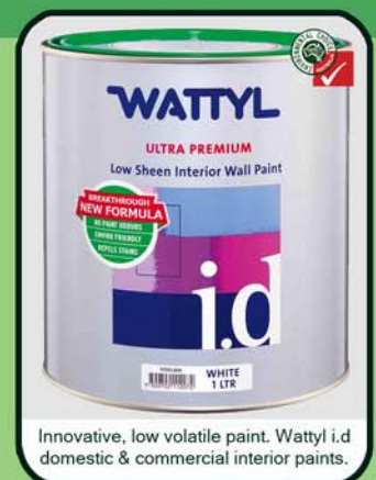
Innovative, low volatile paint. Watty i.d domestic & commercial interior paints.

The two day course is suitable for procurement officers charged with the responsibility of establishing or further developing current procurement practices. The 2-day course includes a take-home assignment for you to design a procurement strategy for your own organisation or situation, which will be assessed by GECA after the course and returned to you to implement straight away.