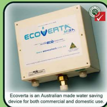
Ecoverta is an Australian made water saving device for both commercial and domestic use.

If you cannot spare 2 days away from work to go to a course, then you and perhaps other people who are a bit new to the idea that buying can be done in a more sustainable manner, can select the 1-day option.